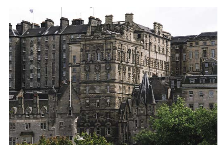
Proposed change will be managed to protect a building's special interest while enabling it to remain in active use. Each proposal will be judged on its own merits. Listing should not prevent adaptation to modern requirements but ensure that

Listed building consent must be obtained where proposals will alter the character of the listed building, regardless of its category or whether the work is internal or external.