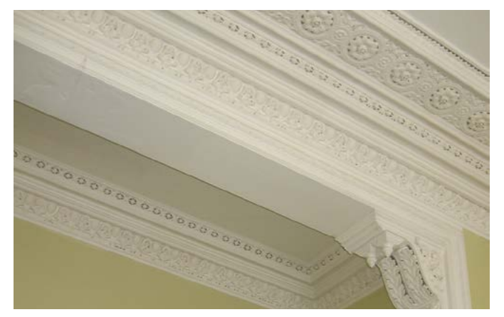
Care should always be taken with works to old plaster to avoid destroying early decoration. All decorative features from a simple cornice or cove

to elaborate wall and ceiling decoration should be preserved. Suspended ceilings should never be formed in principal rooms or entrance halls which have decorative plasterwork. They may be acceptable in minor rooms provided they are above window height.