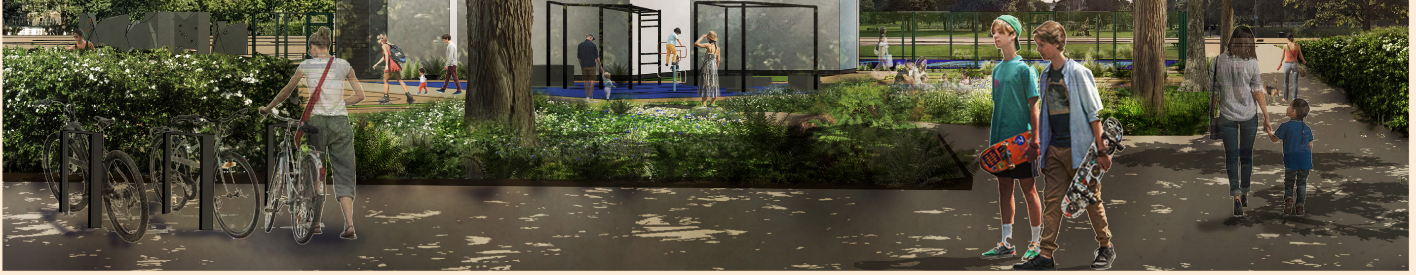
understory planting, hibernac-ulas and areas of dead-

The woodland walk is intended to provide a biodiverse area of the park where the existing mature trees will be accompanied by native