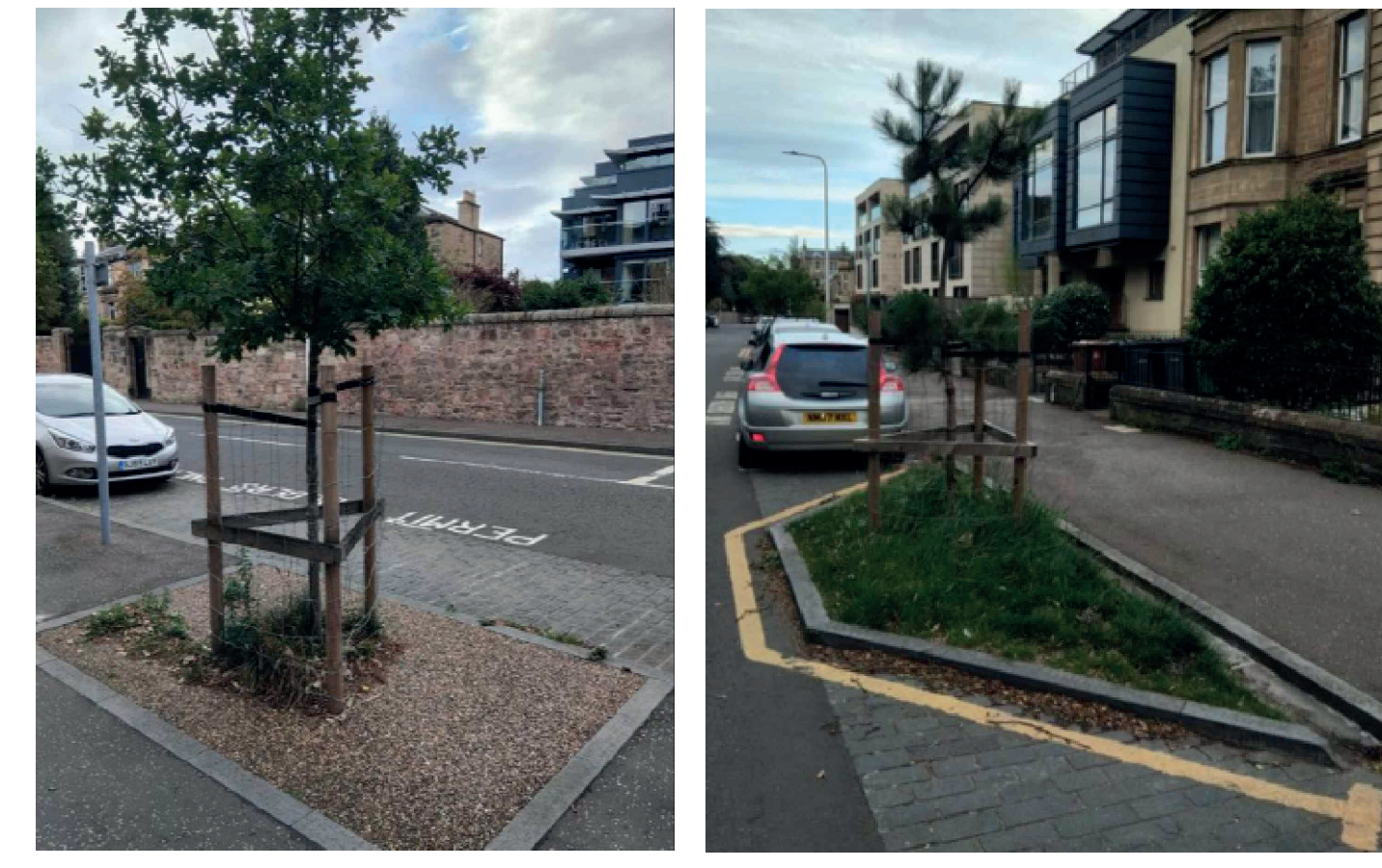
Photos of typical Tree Pits located elsewhere in the City

This map is reproduced from Ordnance Survey material with the permission of Ordnance Survey on behalf of the Controller of Her Majesty's Stationery Office © Crown copyright. Unauthorised reproduction infringes Crown copyright and may lead to prosecution or civil proceedings. 100023420 (2024)