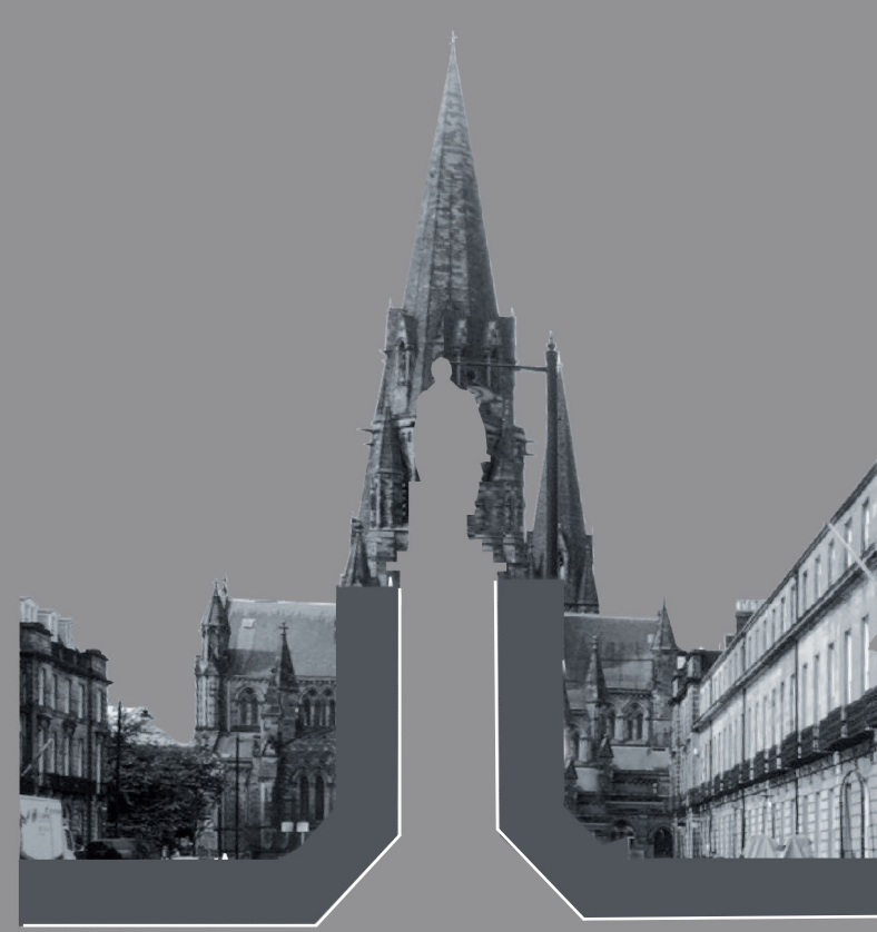
Reimagining Melville Crescent